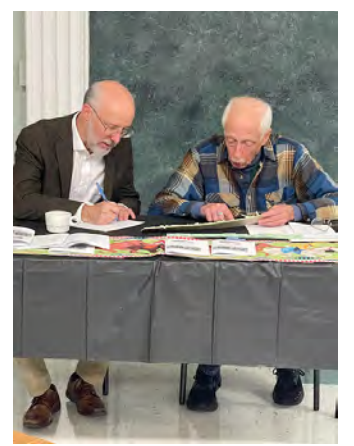
Photos L to R: The odds men - 'pew - got that race calculated'; First course - a mixed greens salad